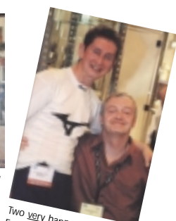
Two very happy Murray Foundation hospital visitors